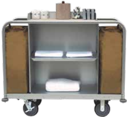
HC-27 23"W x 61"L x 51.5"H