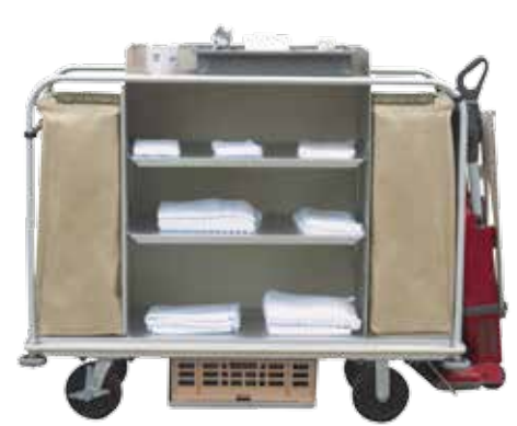
HC-29 23"W x 61"L x 51.5"H