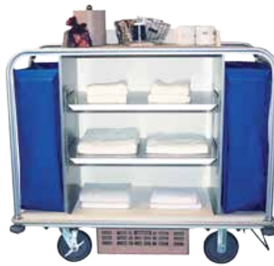
HC-28 23"W x 61"L x 51.5"H

*Tan Aluminum on Exterior of Carts, Interior: Sparkling Silver, Frame: Silver - note other colors available at slightly higher cost please contact us to learn more!