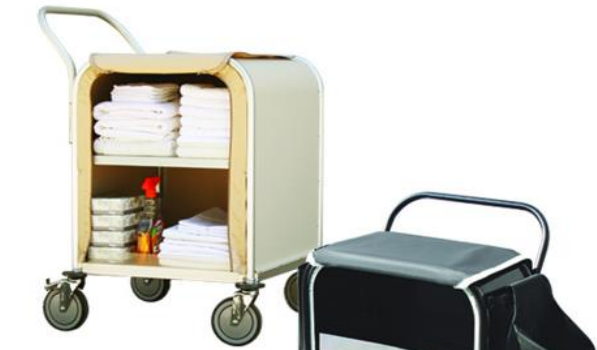
24" W x 24" L x 40" OH

See back page for more Information and Options