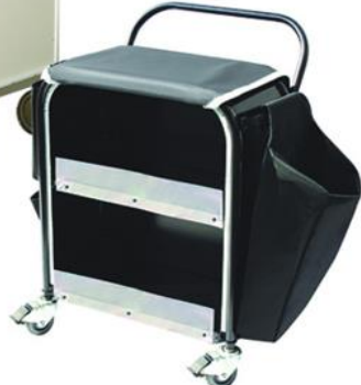
17" W x 24" L x 34" OH