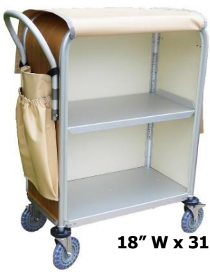
18" W x 31" L x 42" OH