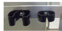
Large and Small Mop/ Broom Clips