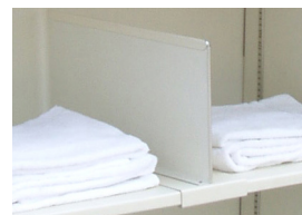
Movable Shelf Divider