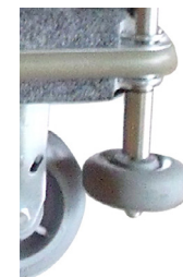
Dropdown Lowered Bumper

6" Or 8" Plate Type Caster and Standard Rolling Bumper